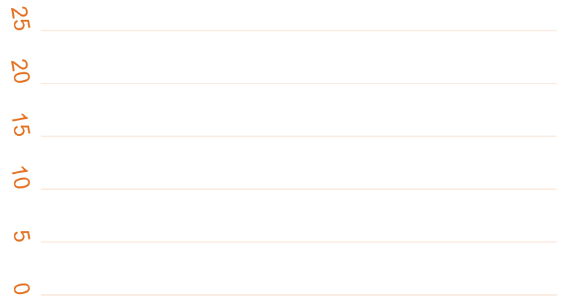
% counseling visits where husband participated